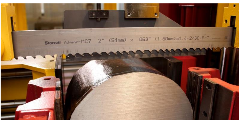
The ADVANZ in action

Discover the future of bandsaw blade production technology with our Bandsaw Carbide Blades, proudly manufactured in Brazil. This innovative line underscores our dedication to advancing cutting solutions while maintaining the highest standards of quality and precision.